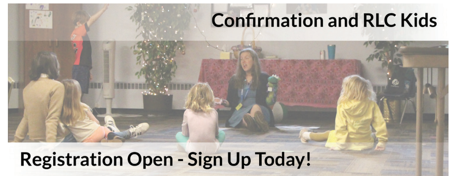
Confirmation and RLC Kids