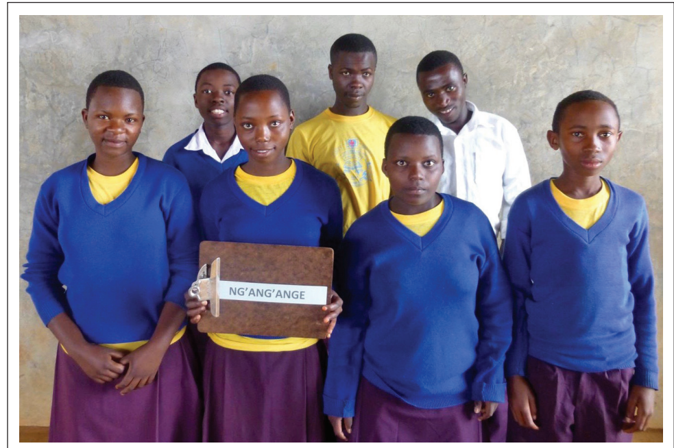
Sponsored students attending Bomalagom'be Secondary School

For over a decade, Roseville Lutheran has been in a companion congregation relationship with a Lutheran parish in Ng'ang'ange, Tanzania. Perhaps the most meaningful aspect of this relationship has been the generosity of RLC members in sponsoring students from the parish who are attending secondary schools. These sponsorships help cover school fees and other costs which enables these young Christians to continue their education beyond the primary level.