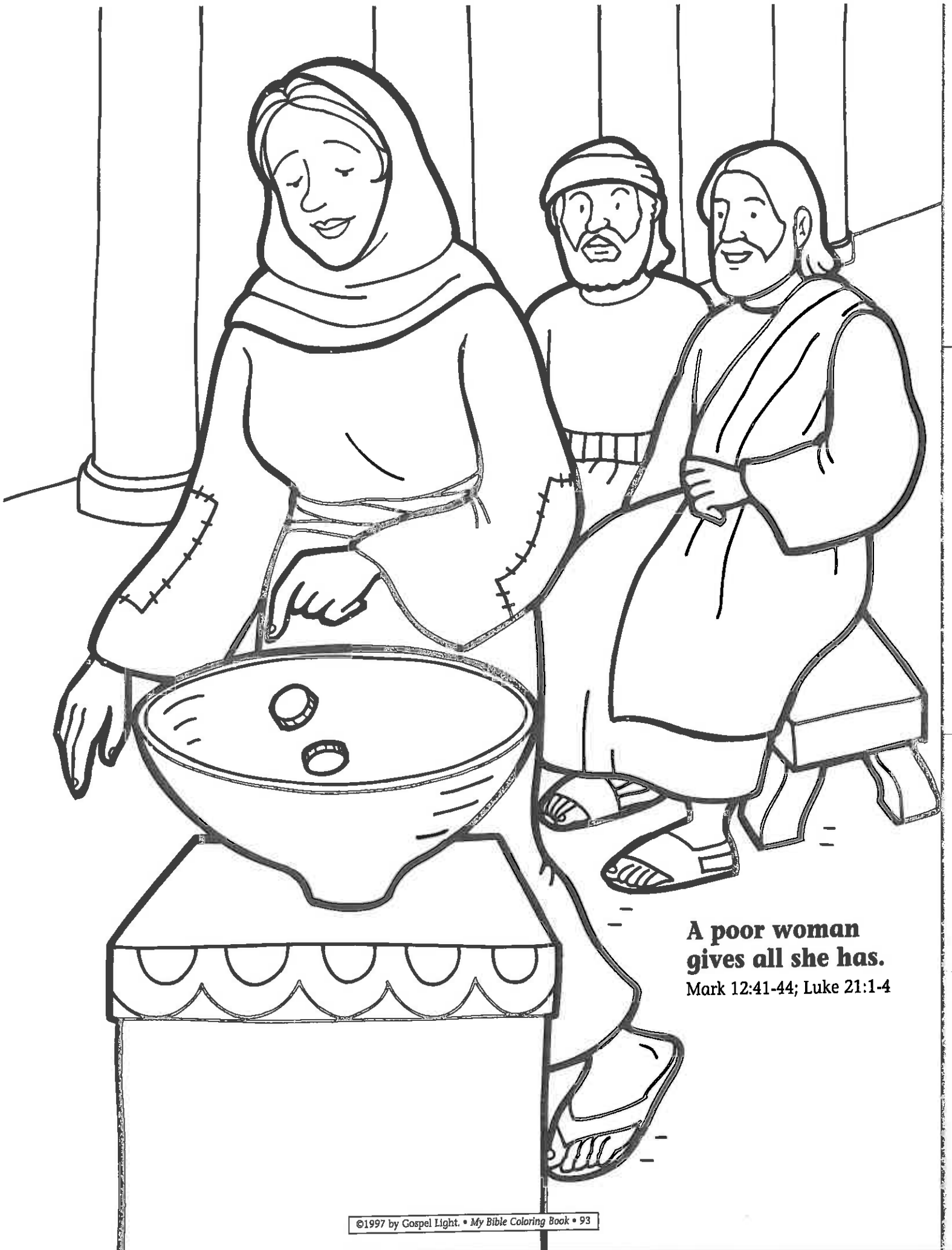
A poor woman gives all she has. Mark 12:41-44; Luke 21:1-4