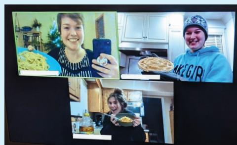
Cooking together over Zoom!